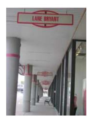
Illustration on the left shows under canopy sign and on the right a projecting sign